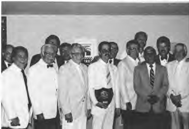
The PAC displays their Award at The Granit.