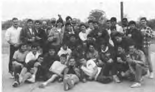
Beta Phi Chapter

to 39 active brothers with the initiation of 11 new brothers.