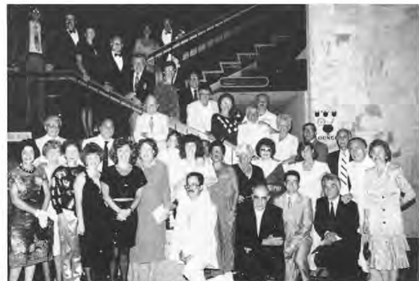
Some of the attendees at the 68th Annual Convention.

Needless to mention, Alpha Phi Delta Fraternity will always share a place in my heart.