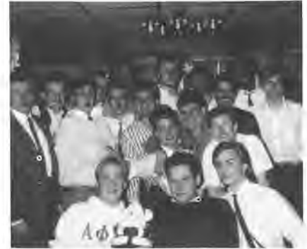
The brothers of Gamma Theta at a monthly dinner.

Most recently we had "Tea Time with Alpha Phi Delta" at our spring fling and also held a "classics night" moviethon. Within the last few months we have started a tradition of having dinner once a month at a local Italian restaurant. Anyone who would like to join us for