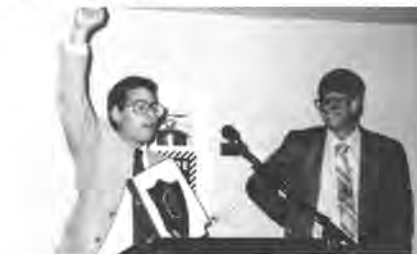
A happy award winner.